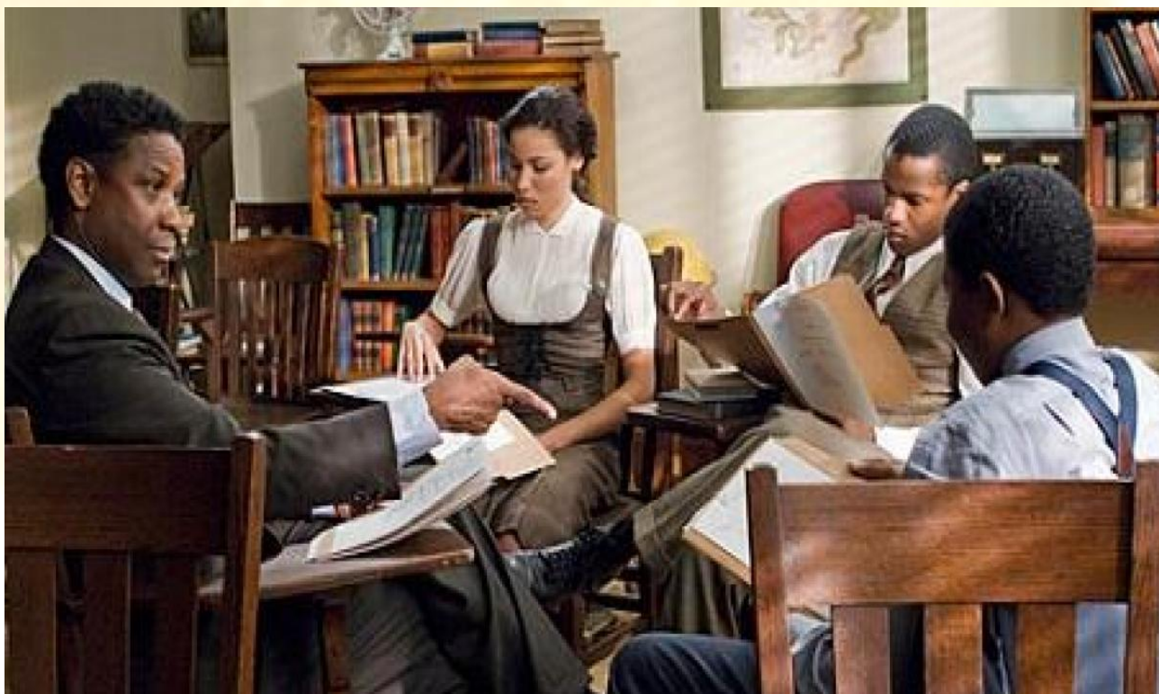
The Great Debaters

Overview: Do you like to argue? The Policy Debate Camp for elementary and middle school students teaches students the key processes of effective debate such as case construction, composing briefs, research, rebuttals, cross-fire, evidence analysis, and summary and final focus. Debate students leave the academic camp with the knowledge, skills, and practical experience needed to excel in life.